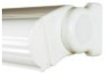
Cassette in closed position