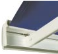
Front rail to arm connector