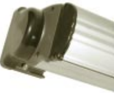
Steel finish cassette