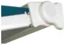
Gear and arm assembly