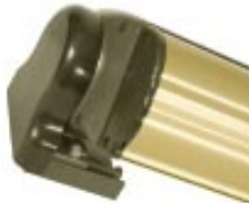
Bronze finish cassette