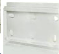
Double Base Bracket