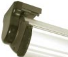
Silver finish cassette